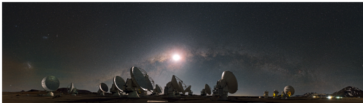
Figure 6.20 Atacama Large Millimeter/Submillimeter Array (ALMA). Located in the Atacama Desert of Northern Chile, ALMA currently provides the highest resolution for radio observations.

The Atacama Large Millimeter/submillimeter array (ALMA) in the Atacama Desert of Northern Chile ( Figure 6.20 ), at an altitude of 16,400 feet, consists of 12 7-meter and 54 12-meter telescopes, and can achieve baselines up to 16 kilometers. Since it became operational in 2013, it has made observations at resolutions down to 6 milliarcseconds (0.006 arcseconds), a remarkable achievement for radio astronomy.