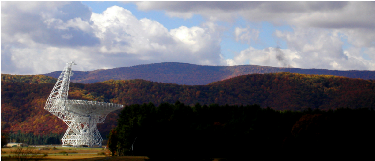
Figure 6.19 Robert C. Byrd Green Bank Telescope. This fully steerable radio telescope in West Virginia went into operation in August 2000. Its dish is about 100 meters across.