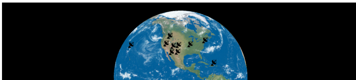
Figure 6.21 Very Long Baseline Array. This map shows the distribution of 10 antennas that constitute an array of radio telescopes stretching across the United States and its territories.

The United States operates the Very Long Baseline Array (VLBA), made up of 10 individual telescopes stretching from the Virgin Islands to Hawaii ( Figure 6.21 ). The VLBA, completed in 1993, can form astronomical images with a resolution of 0.0001 arcseconds, permitting features as small as 10 astronomical units (AU) to be distinguished at the center of our Galaxy.